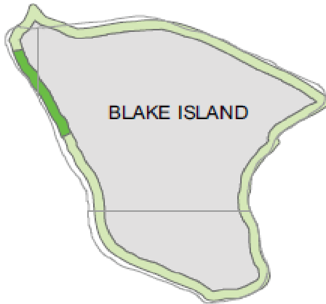
Existing Shoreline Environment Designations, Blake Island, 1999