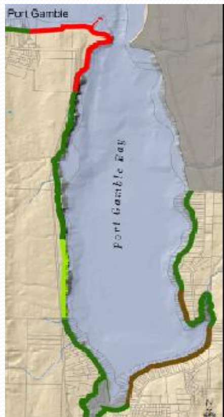
Preliminary Draft Shoreline Designations, Port Gamble Bay