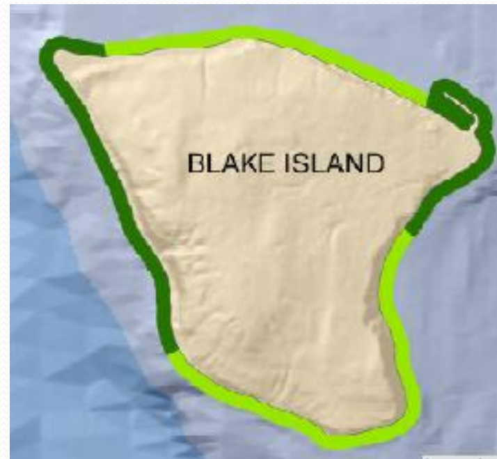
Preliminary Draft Shoreline Env. Designations